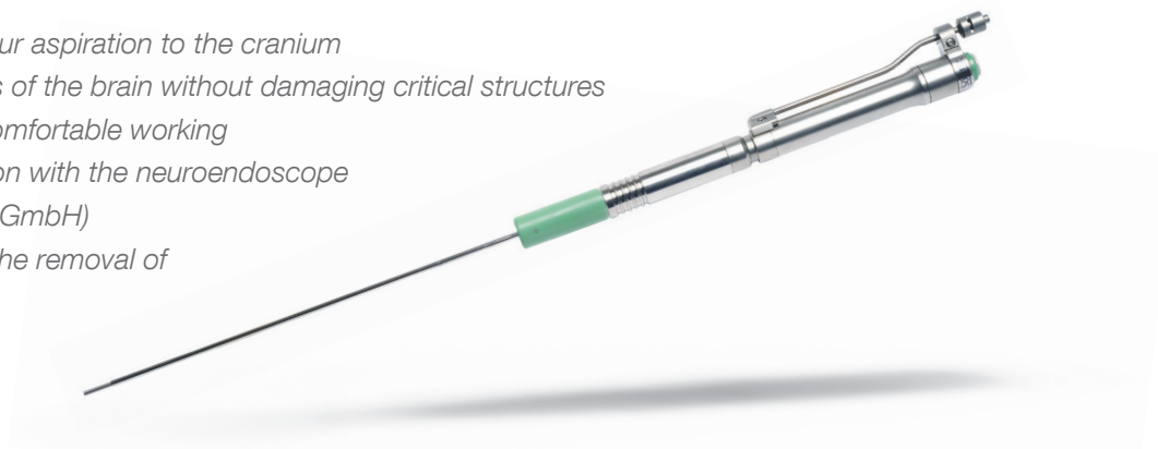
92-030 Micro-handpiece (model Gaab), long, straight