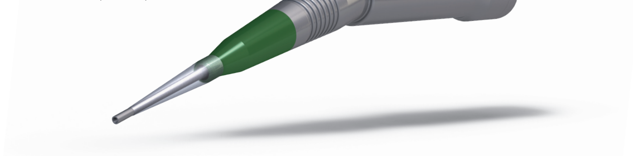
92-020 Micro-handpiece, short, angled