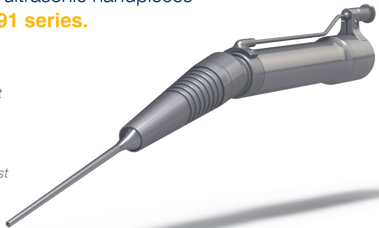
91-020 Micro-handpiece, short, angled